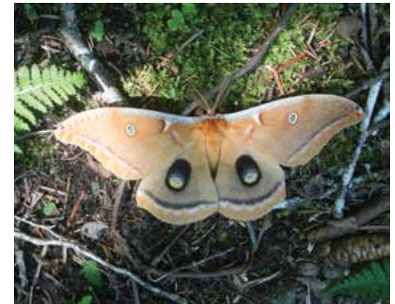
Polyphemus moth just after emerging in June

The forested trail at Polly Cove may be short, but it offers surprising diversity compared to most of the island, thanks to its distinctive Hardwood Seepage Forest Natural Community (listed as rare in Maine). Hardwoods like sugar, red, striped, and mountain maple, paper and yellow birch, and bigtooth aspen are in abundance, and the ample sun and ground water allows a full range of shrubs, ferns, and wildflowers as well; lady slippers and red baneberries can be found, for example. In all, there have been 160 different species of plants identified here.