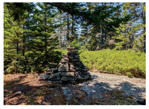
Historical stone cairn marking the summit.

The Barton's Quarry Preserve is a great place to visit in August and September, when the sea breeze is balmy and the huckleberries are ripe. It offers a glimpse of Vinalhaven's granite-cutting past from a lofty vantage point where eagles and ospreys often fly by at eye level. By next spring, we will offer a brochure, and the trail will be posted on the VHtrails smartphone app.