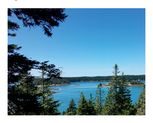
View looking south from the summit of Barton's Quarry.

Eventually the trail, still climbing, emerges onto open granite ledges that begin to hint at the panoramic views that lie ahead. When you see a five-foot-tall cairn of stones, you'll know you've reached the top—but the best view is yet to come. Turn left here, and a hundred-yard-long spur trail will take you out to a breathtaking overlook of Vinalhaven, Isle au Haut, Green's Island, Hurricane Island, and The Reach; all framed by the mature red spruce trees on either side of you. Sit on the soft, dry moss in the shade of the spruces and enjoy a picnic lunch while a sea breeze cools you and the ferries and lobster boats pass by far below—it's hard to leave this postcard-worthy spot, and you may even decide that a short nap is in order.