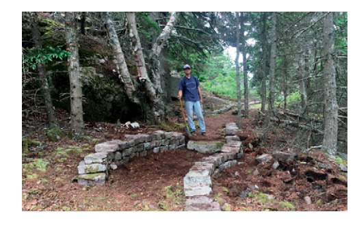
VLT summer intern Aryeh Lieber, at work on the Belgian block edging of the loop trail.

The loop trail starts at the water's edge and is best experienced by following it counterclockwise (SSE), as it follows the old road along which men would have driven teams of oxen pulling carts of granite to the pier, where barges and schooners could be loaded. As the trail ascends, its right-hand edge is lined with the hundreds of Belgian blocks left behind when the quarry closed; while on the left-hand side, you'll catch glimpses of the vertical splits in the wall of ledge, showing exactly where the quarrying stopped.