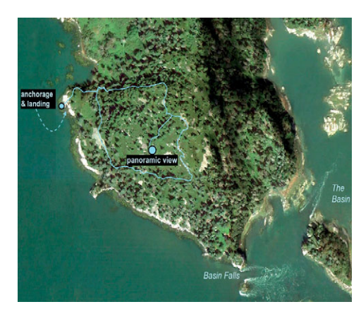
Aerial view of the Barton's Quarry Landing and Trail

To visit this preserve, you'll need to approach by boat to some large seaside ledges