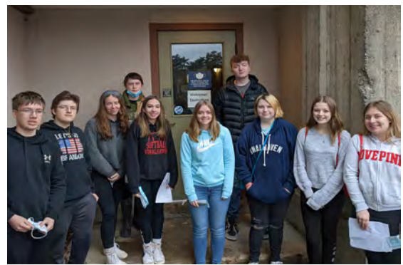
High school students attending the Envirothon training in Orono and a middle school student designing his 3D printer lobster trap for the HICS&L project.

At Vinalhaven School, many exciting environmental education programs are underway or have already happened this spring, and boy, does it feel good to see the students outside and learning all together again!