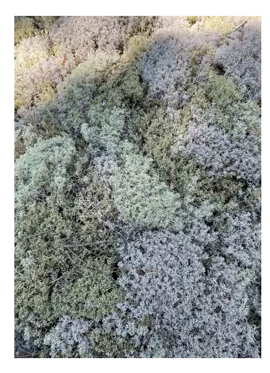
Lichens on the "wedding cake" section of the Vinal Cove Trail.