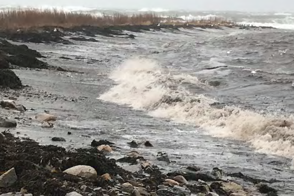
A wild day at State Beach!

VLT is excited to be partnering with the town's Sea Level Rise Committee and the Gulf of Maine Research Institute (GMRI) in bringing the Ecosystems Investigation Network to the island later this year. This community science opportunity supports field-based collaborative research into the climate-driven changes happening in the Gulf of Maine and its watershed. The Network includes locally and regionally focused projects designed to engage participants in rewarding work and generate scientific data and understanding. This Network—its tools, people, and guides—is designed to be a resource for scientists and communities to create projects involving all kinds of people, from middle school students to seasoned sportsmen. The participants collect and consider data to reveal new patterns and new understandings of how climate change is impacting our region's species, communities, and habitats. Through connected efforts and conversations, it is our hope that what we uncover together gives us all a better understanding of the effects of climate change on our regional watershed system. You can learn more about the Network at investigate.gmri.org.