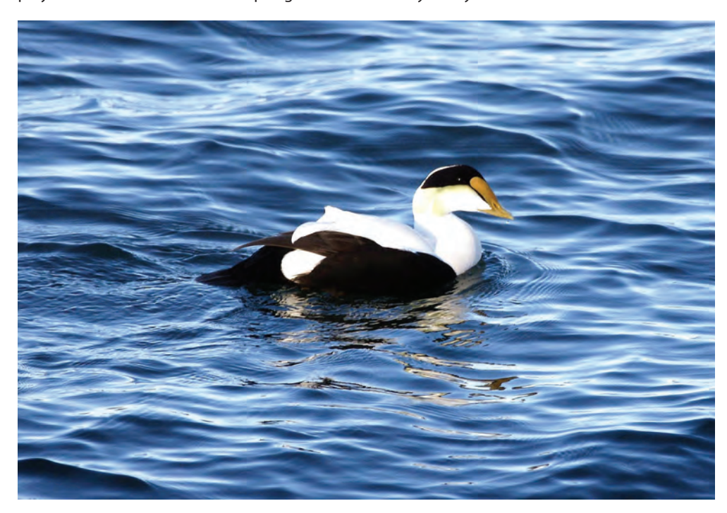
Photo above: Common eider ducks are one of the many nesting birds in Vinalhaven. Photo at right: The name mourning dove refers to their soft lamenting calls.