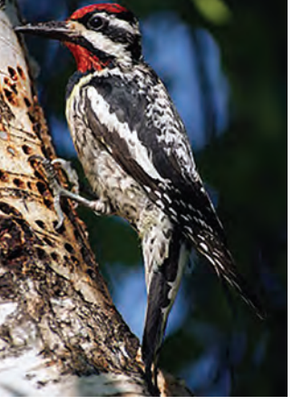
The yellow-bellied sapsucker is one of the many birds that can be seen (and heard!) on a bird walk.

Photo below: Kirk leading a Thursday morning bird walk at State Beach.