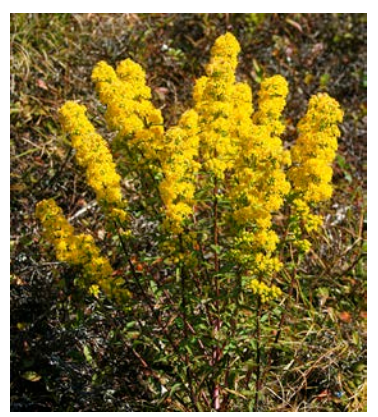
Showy goldenrod adds color in August

Energetic hikers will enjoy the steep trails and rocky ledges on the Long Cove Loop Trail, as well as the chance to step out at the head of Long Cove. Please enjoy the view at this spot quietly, as there are neighbors who also enjoy its serene beauty.