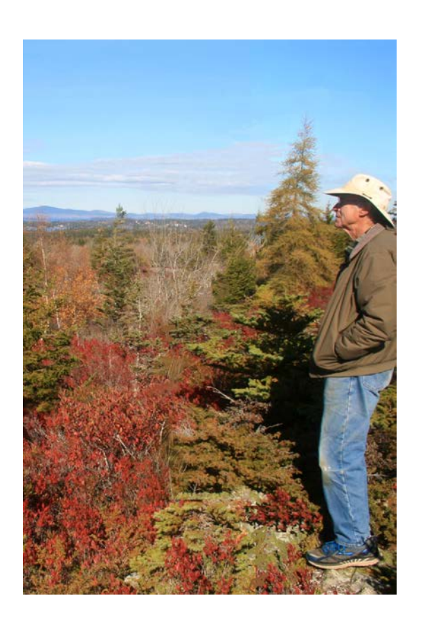
Owned by Town of Vinalhaven