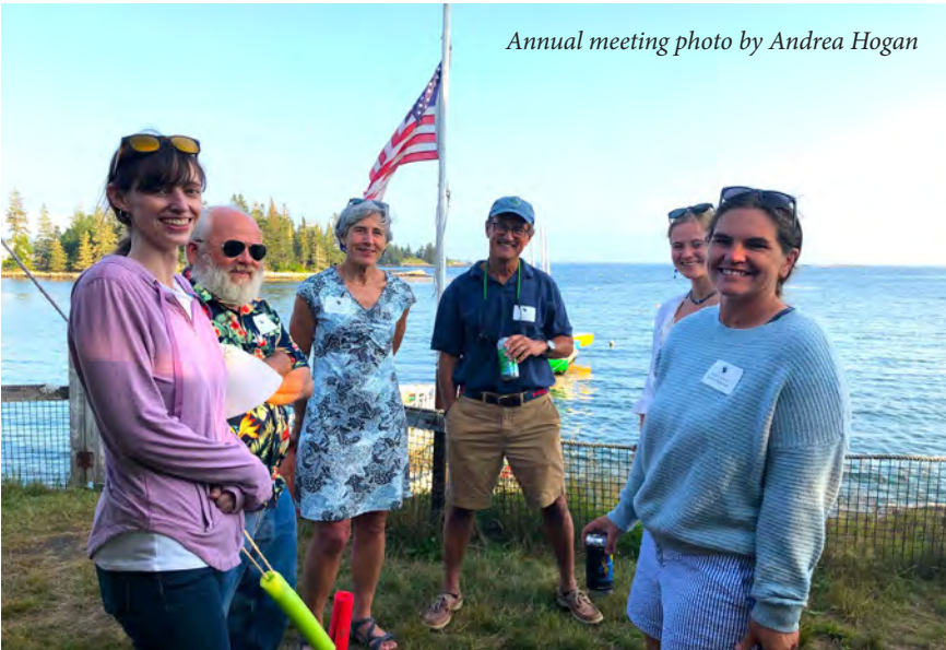
Annual meeting