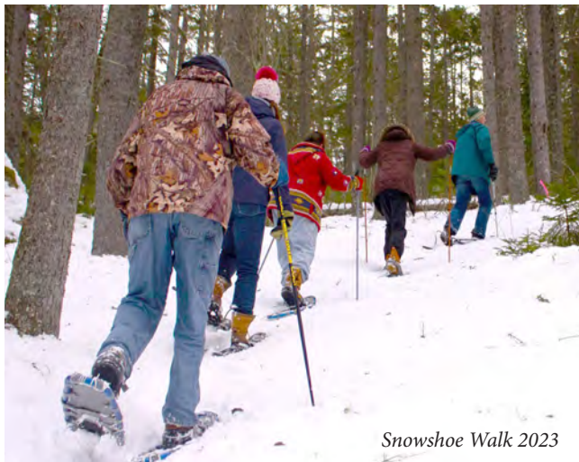
Snowshoe Walk 2023

You can also make a gift of appreciated securities. In addition to being able to claim a charitable income tax deduction for the full market value of the shares, you also avoid paying a capital gains tax on appreciation. You can donate by mail, phone at 207-863-2543, or securely online at vinalhavenlandtrust.org/donate . Thank you!