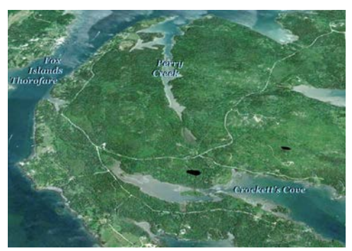
Looking east at the Thorofare and Perry Creek

The larger brook is called Indian Ladder Brook—where did that name come from? It suggests that there was some kind of a struc-