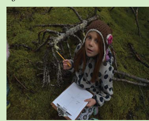
PAS students did basic plot studies on Granite Island preserve, counting lichens and mosses.