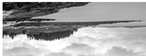
CONSERVING THE NATURE OF VINALHAVEN