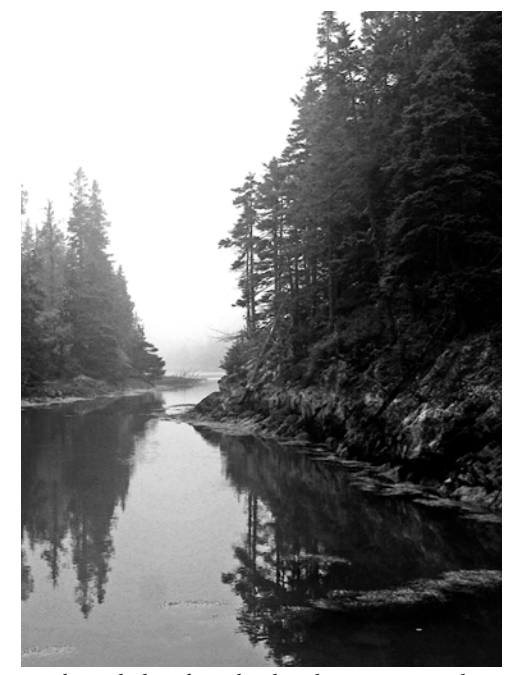
Enshrouded in fog, this lovely cove exemplifies the shorefront near Tip Toe Mountain. VLT's 25th Anniversary Campaign is raising money to purchase this property. Read more to see how you can help.

As we go forward this summer with the final phase of the campaign, be on the alert for notices of the many walks and other events centered on Tip Toe and our stewardship of all our preserves. We invite your participation and support. For more information, please call or stop by the office, or visit us online at www.vinalhavenlandtrust.org.