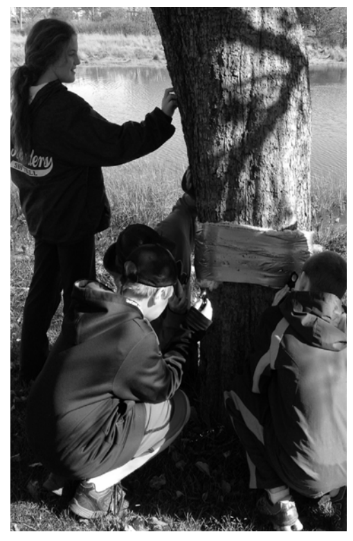
When a flightless female Winter Moth climbs a banded tree, heading for the top to lay her eggs, she is trapped in the sticky barrier. Members of the VLT sponsored Vital Signs Club monitored the bands last fall, tracking the locations and numbers of adult moths.