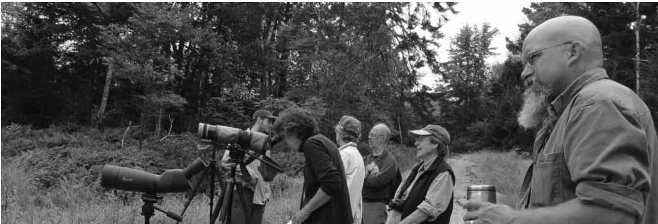
Looking for the elusive eagle at Folly Pond. The eagles were not eager to appear.