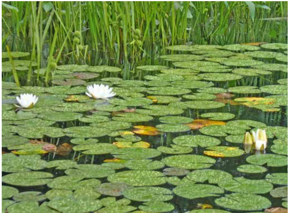
Photo, right: water lilies at Folly Pond. Below: students hauling scallop cages at Hurricane Island.