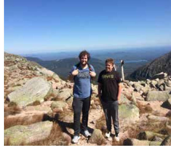
An 8th grader and a high school student leader make it to the top of the very challenging Saddle Trail together, on the Mount Katahdin camping trip.