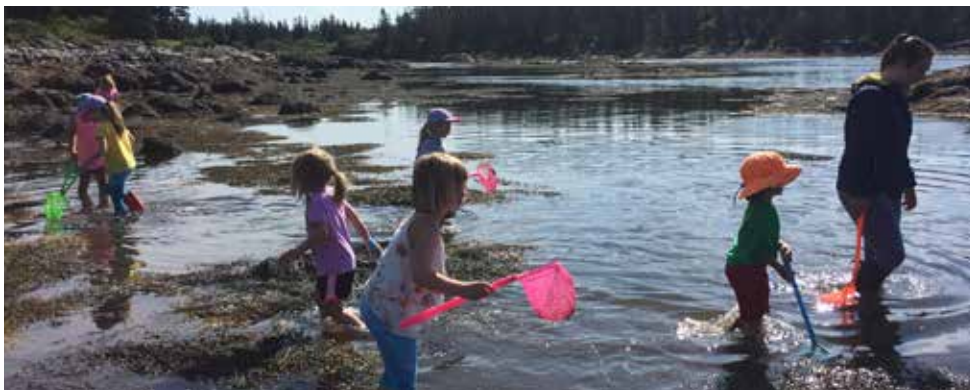
Island Explorers summer camp exploring Lane's Island with dip nets.

You may donate by mail or securely online at vinalhavenland-trust.org/donate , or by phone at 207.863.2543. Thank you!