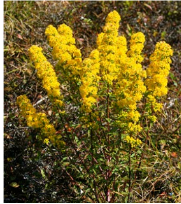
Showy goldenrod adds color in August

Energetic hikers will enjoy the steep trails and rocky ledges on the Long Cove Loop Trail, as well as the chance to step out at the head of Long Cove. Please enjoy the view at this spot quietly, as there are neighbors who also enjoy its serene beauty.