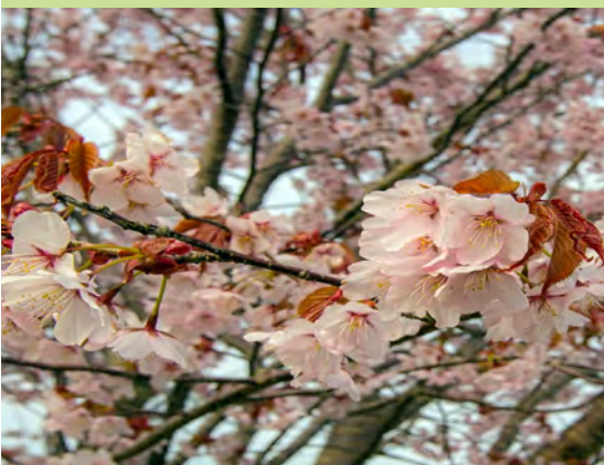
The many apple trees on Vinalhaven are blooming all over the island.

Renew by using the response card we recently mailed out, the form on the back of this newsletter, or the "Donate Now" button on our website: vinalhavenland-trust.org . Thank you for your support!