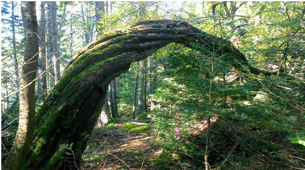
Arched maple on the new Round Pond trail. Photo and story by Kerry Hardy.

This new trail at Round Pond was established thanks to the generosity of the Vinalhaven Water District, along with two private landowners, all of whom allowed us to route the trail over their properties. We ask that visitors please help us by staying on the established trails and by taking extra pains to keep the parking area and trails free of litter, as a way of thanking them for extending this privilege to Vinalhaven's hikers. We hope to meet many of you on these new trails in the coming seasons.