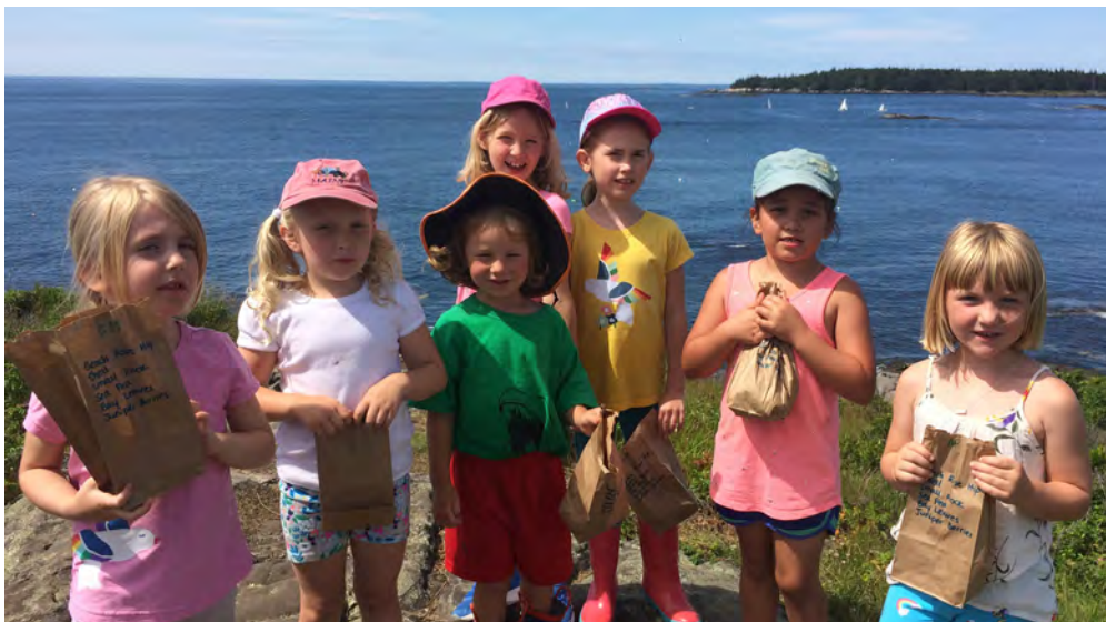
Island Explorers learn about the ocean ecosystem at Lane's Island.