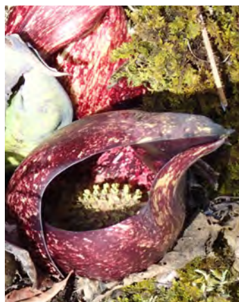
Skunk cabbage is an early harbinger of spring.