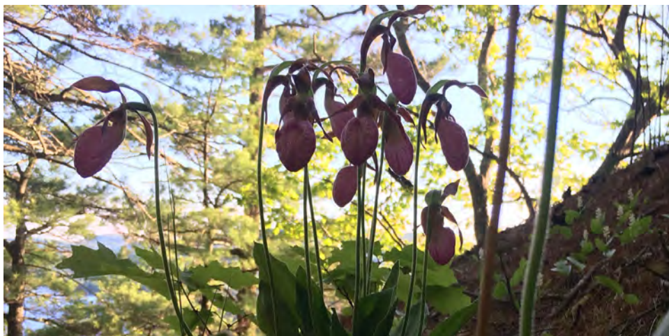
Above: Start looking for lady slippers in late May. Huber is the best place to find them, but they can also be found on Starboard Rock and Fish Hook Preserve. Below left: Starboard Rock offers long views of the islands, and Acadia Mountains to the northeast over the waters of Penobscot Bay. Below right: There are many trails at Tip Toe Mountain. Climb “Little Tip Toe” for views of Crockett’s Cove, and “Big Tip Toe” where a bench awaits you with the Camden hills in sight. The shore trail brings hikers to a beach for further exploration.