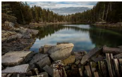
The Bathing Pool.