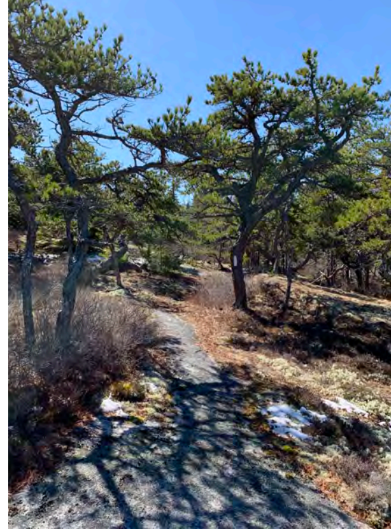
The pitch pine woodland at Watershed Preserve sits atop a beautiful granite dome. This woodland is unique for its age (130 years).