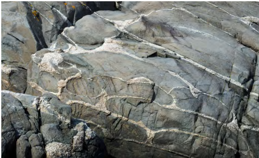
An example of "pillow mounds", found on both Pocus Point and Lane's Island.

mont. The rocks that today comprise Maine had not yet been added to Laurentia, but were parts of offshore island chains and microcontinents, many of which were volcanic in origin. These islands likely resembled the volcanic archipelagos of present-day Japan or the Aleutian Islands off Alaska, which form above tectonic "subduction zones" where plates collide.