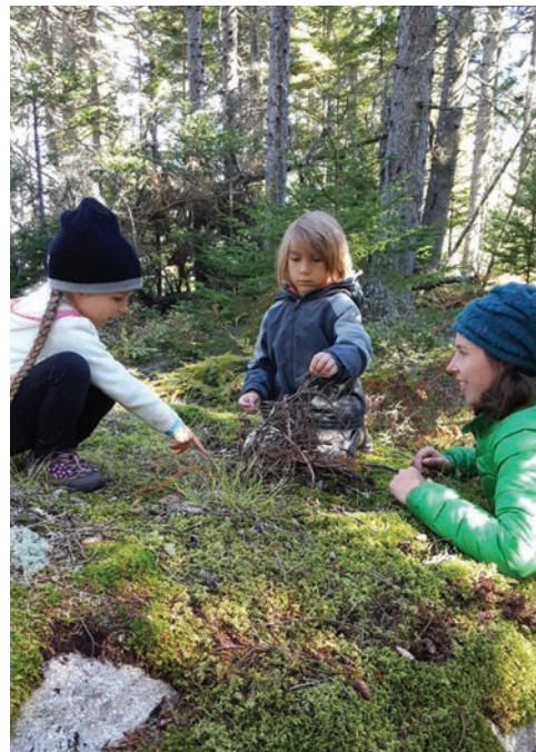
K-1-2 on Granite Island Preserve with Tanglewood instructors for their annual fall outing.

educators gently encourage respect for the land, the moss, and the creatures they might encounter. Equipped with hand lenses, students examine lichens or decomposition on logs. They sort woodland finds into categories,