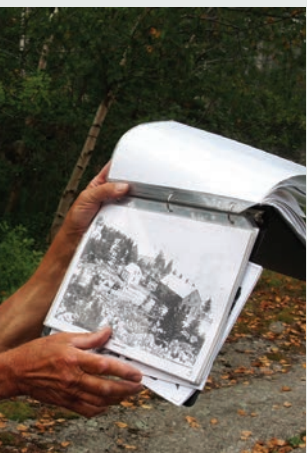
Photo of quarrying days