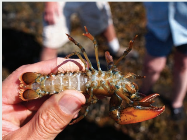
Above: Brian Beal led a popular walk at Lane's Island. Right: Gathering mushrooms at Granite Island Preserve.