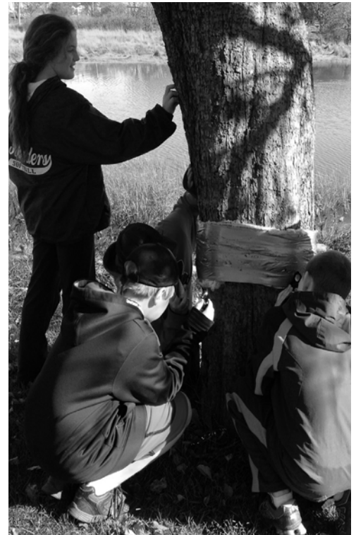
When a flightless female Winter Moth climbs a banded tree, heading for the top to lay her eggs, she is trapped in the sticky barrier. Members of the VLT sponsored Vital Signs Club monitored the bands last fall, tracking the locations and numbers of adult moths.