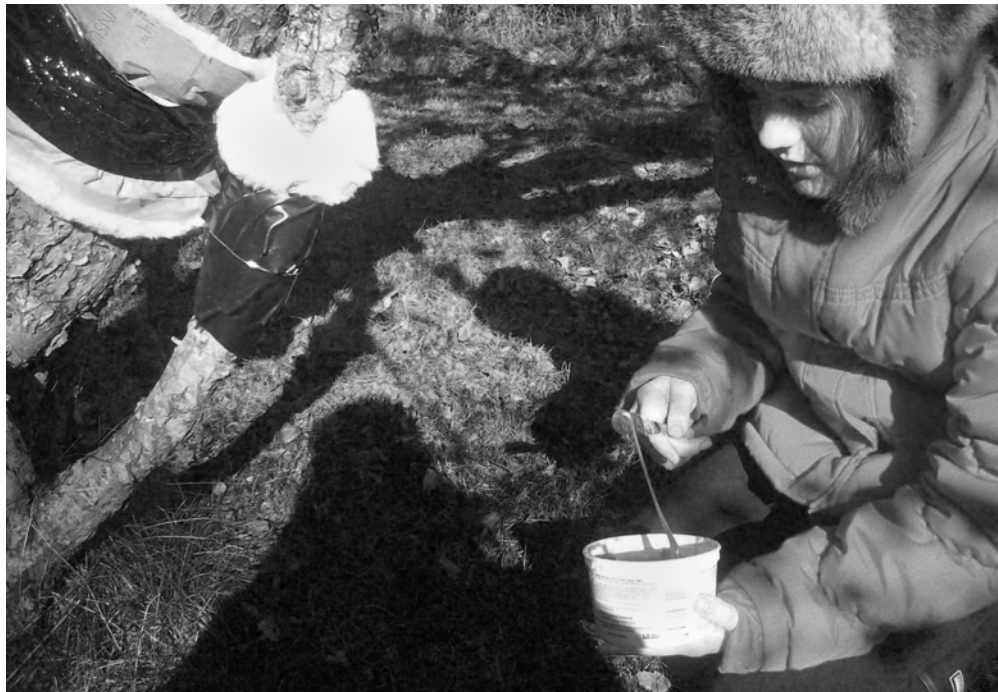
A student applies a sticky barrier to a tree banded to monitor the population and spread of Winter Moths on Vinalhaven. This invasive species targets the island's hardwood trees.