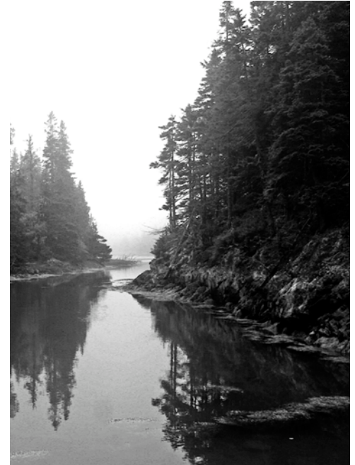
Enshrouded in fog, this lovely cove exemplifies the shoreline near Tip Toe Mountain. VLT's 25th Anniversary Campaign is raising money to purchase this property. Read more to see how you can help.