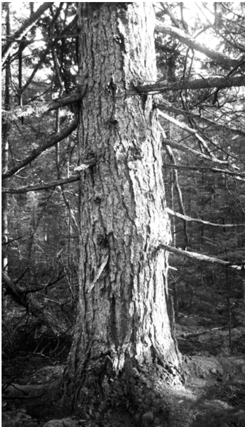
This red spruce might be one of the largest on the island.